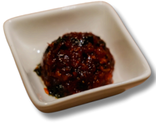
Spicy Tare $2