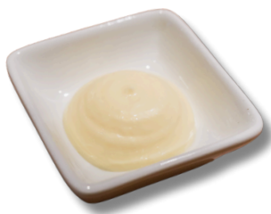
Garlic Mayo $2

Aji-hen! Explore bold new flavours designed to elevate your Saito Ramen and take your experience to the next level!